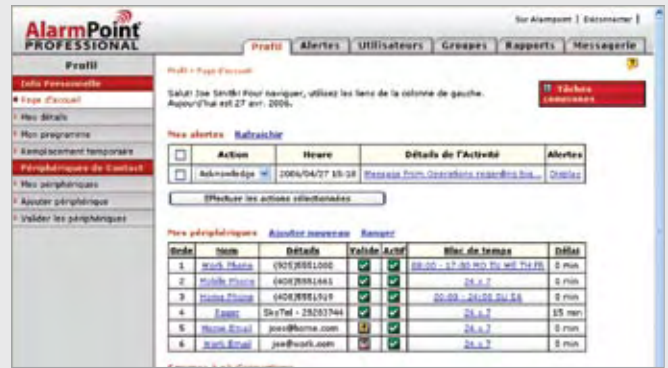
Enhance AlarmPoint user experiences with optional localized user interface in 12 languages, including double byte support (French shown).