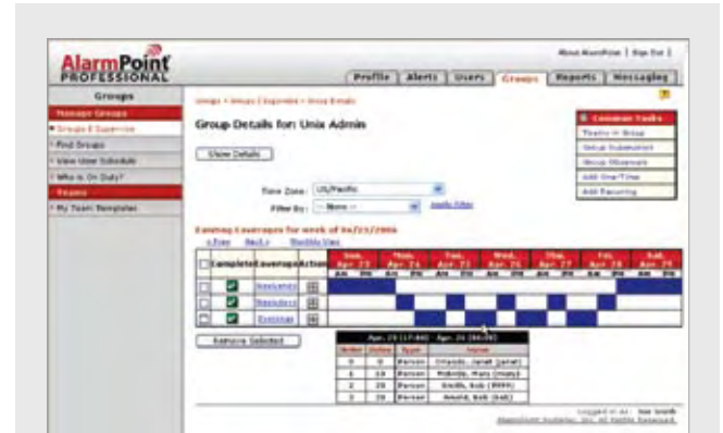
Flexibly manage work group scheduling, follow the sun groups, rotations and on call reporting.

This powerful capability gives group owners the ability to manage their teams, create recurring and one-time schedules, automate rotations, handle temporary replacements, create round-robin groups and groups-in-groups, and establish sophisticated group permissions to allow view and edit rights to their group. Because AlarmPoint Professional has several